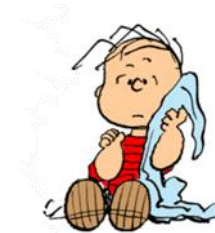
Happiness is a warm blanket ~Linus van Pelt

Happy Times is a simple, easy-to-use resource to help families with preschool school-aged children share faith in Christ at home. Happy Times is full of age-appropriate stories, games, puzzles, and activities. Booklets are free, and April - May editions are available today on the resource wall in the lower narthex/lobby.