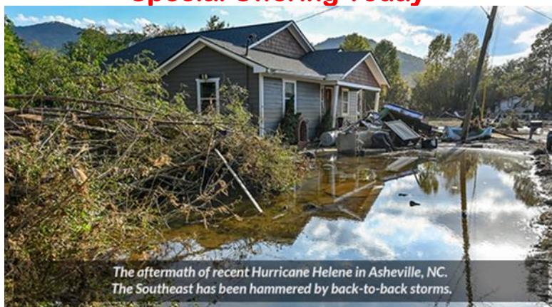
The aftermath of recent Hurricane Helene in Asheville, NC. The Southeast has been hammered by back-to-back storms.