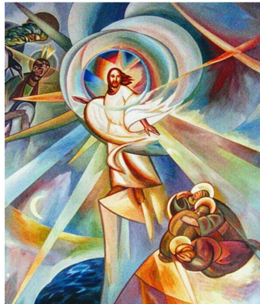
Transfiguration of our Lord Sunday

Join us all 6 Wednesday nights, starting Ash Wednesday, March 5 th . Wednesday night worship services start at 7PM. A Fellowship Supper is offered before each service, 5:46 – 6:45PM, for a free-will offering.